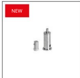
FASTENER SET FI-8-MR-2 C28137