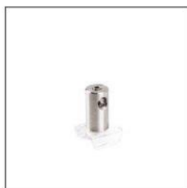
FASTENER K-10-PP C28235N00