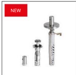
FASTENER SET FI-8-MR-1 C28136