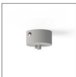
CANOPIE Fi-60mm C24540