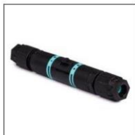
HERMETIC COUPLER THB.381, 2pin C28125C07