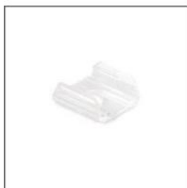
MOUNTING BRACKET K-10 C24340C00