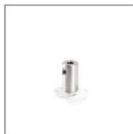
FASTENER K-10-WP C28236N00