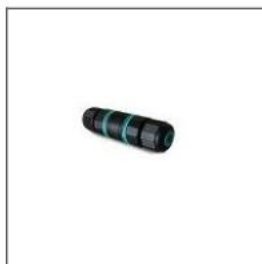
HERMETIC COUPLER THB.391.A5A, 5 pin C28156C07