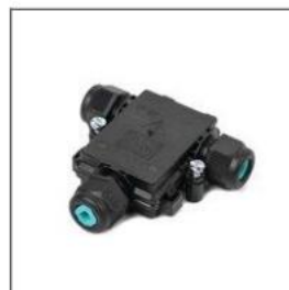
JOINT CONNECTOR THB.200.E5E, 5 pin C28157C07