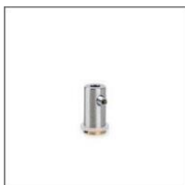
FASTENER FI-8-PRET-MR C28187