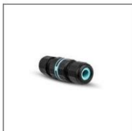
HERMETIC COUPLER THB.391.A4A, 4 pin C42268C10