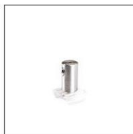
FASTENER K-10-WL C28237N00