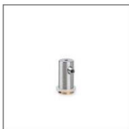
FASTENER FI-8-LIN-MR C28172N00, C28172L10, C28172L07